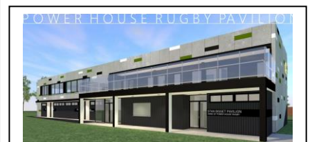
Proposed Plan of Clubrooms

Tax deductible donations can be made to the Power House Rugby Union Foundation Inc. https://asf.org.au/donate/power-house-rugby-project/